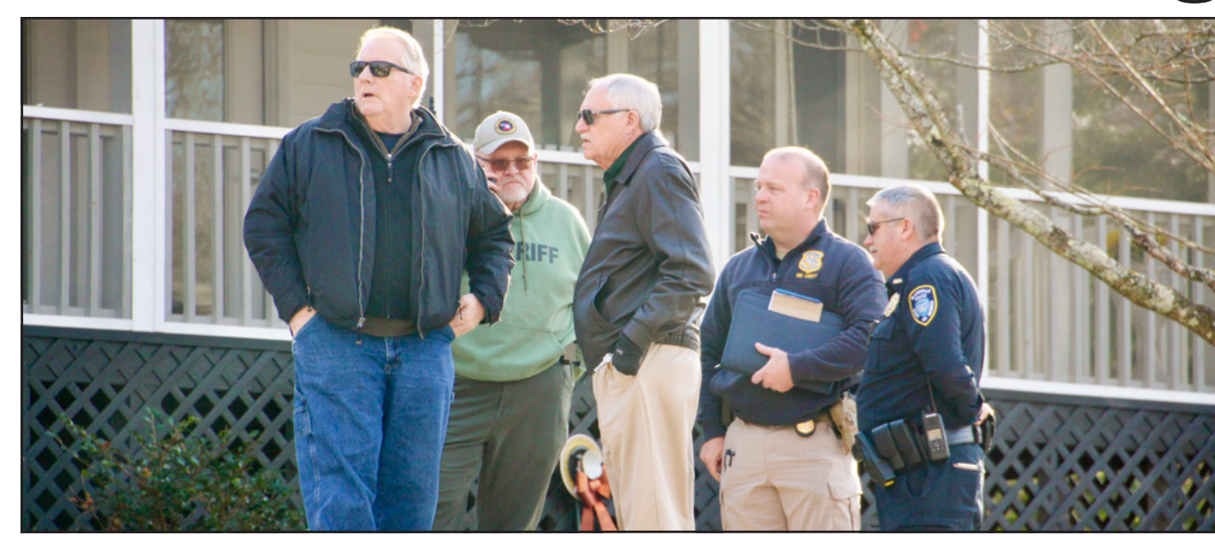
The Union County Sheriff's Office with a GBI agent at the scene of the officer-involved shooting Feb. 18.

According to the Georgia Bureau of Investigation website, this is the ninth officerinvolved shooting of 2024 in the state of Georgia, and the second fatal one.