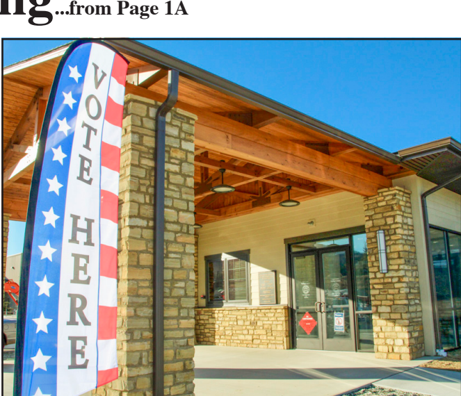
People can vote early now at the Union County Voting Center, located just across from Union County High School on the Glenn Gooch Bypass.

Monday, Feb. 12, was the registration deadline to Dec. 3. vote in this election.